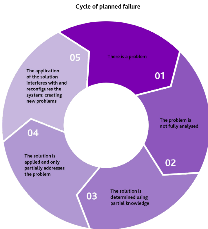
Figure 1: Cycle of planned failure

His model emphasises the following cycle: